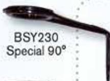
BSY230 Special 90°