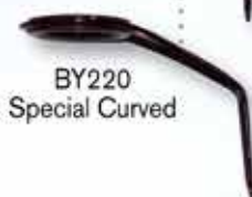
BY220 Special Curved