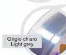
Grigio chiaro Light grey